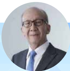
Dr. Siri Jirapongphan Honorary Co-Chair (Former Minister of Energy, & Director of Bangkok Bank Public Company Limited)